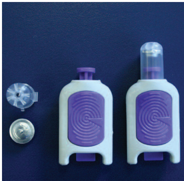
VersiDoser delivery device with blister

production line; the sealed blisters containing the drug formulation are then separated and loaded into an injection molded, single-use, disposable delivery device (see photo above). The product remains sterile until dispensed and comes into primary contact with only the laminate and the micropump, both of which are composed of USP class materials.