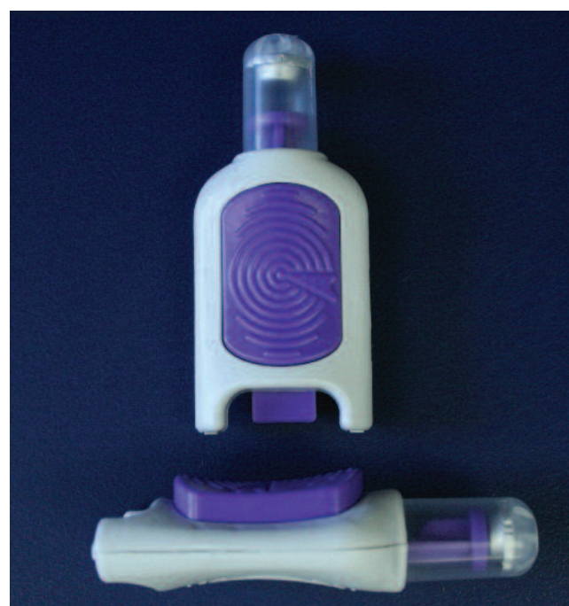
Device with actuator platform raised